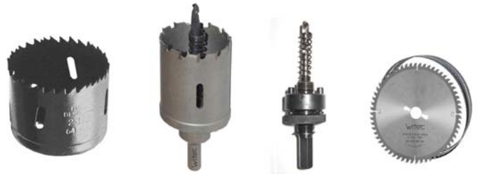
HOLE SAWS AND SAW BLADES