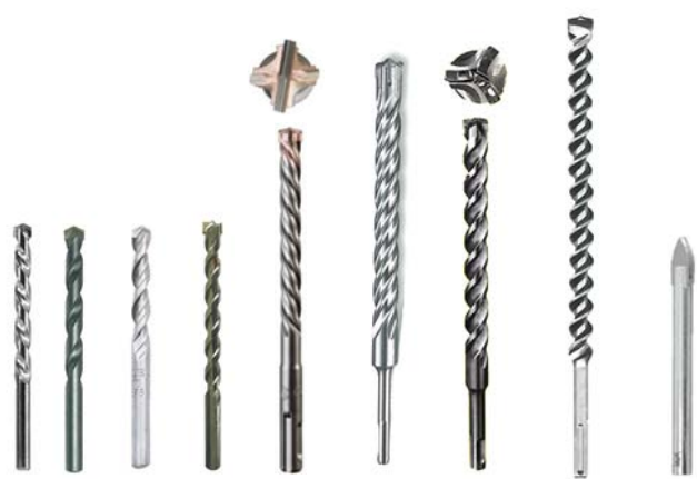
MASONRY AND CONCRETE